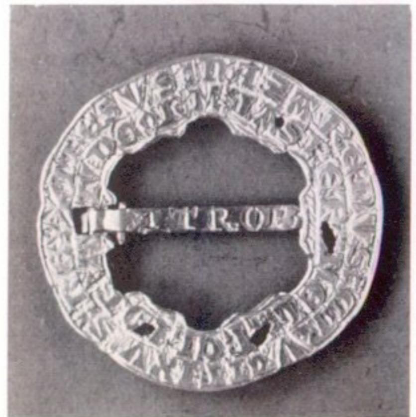
Above, the Kames Brooch, enlarged to show detail. Below, the Kames Brooch and the Islay Brooch, actual size